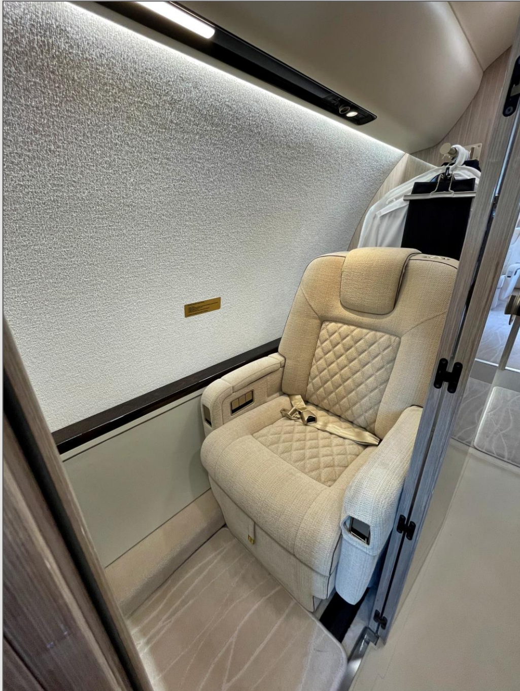
FWD CREW REST