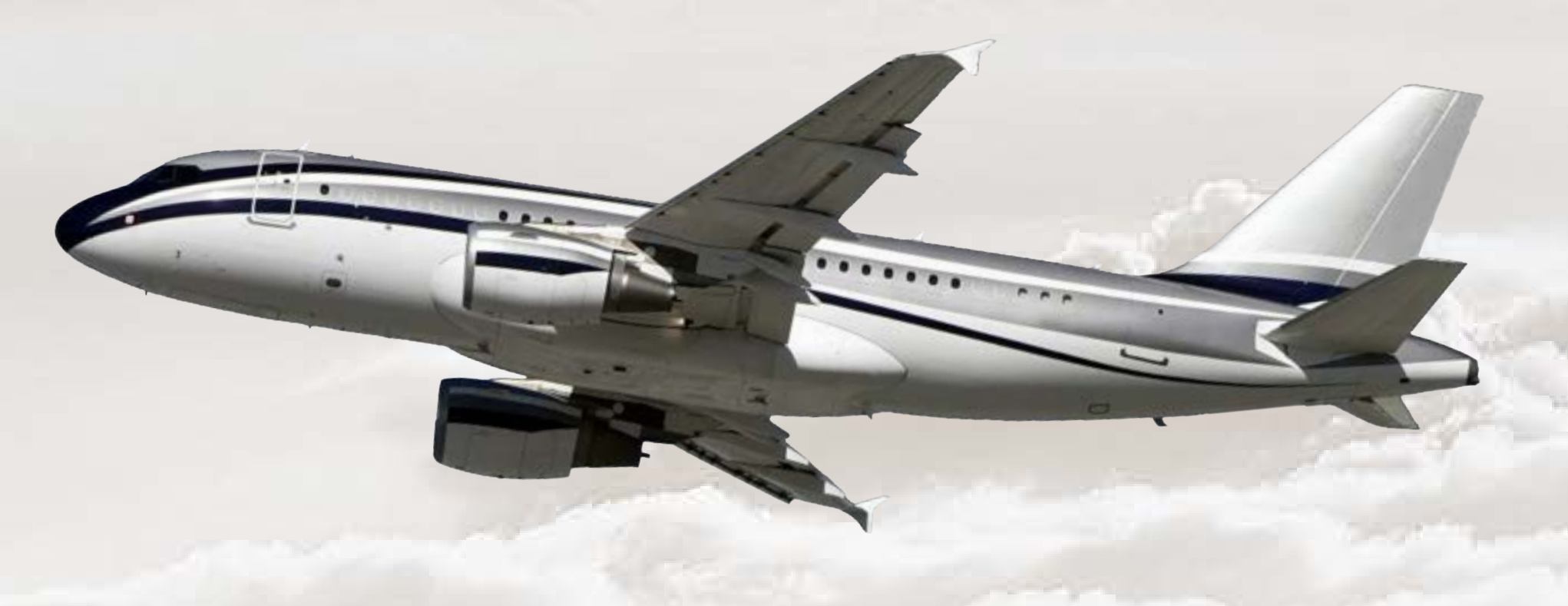
16 Passengers • 5 Additional Center Tanks • EASA Compliant