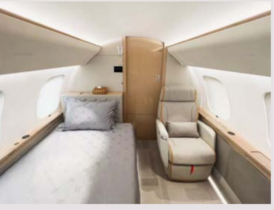
This 2022 Global 7500 distinguishes itself for its spaciousness and extensive range. The aircraft's delicately tailored interior boasts four authentic living spaces, a generously sized galley, and a crew rest area. TTSN: 387 Hours • More information on www.opusaero.com